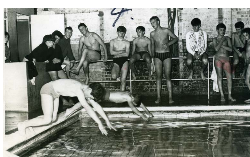
Diving inside the Public Swimming Baths in Hill Street 1963/64

Go to 'Recognise Anyone?' board to spot more familiar faces from the 60's onwards