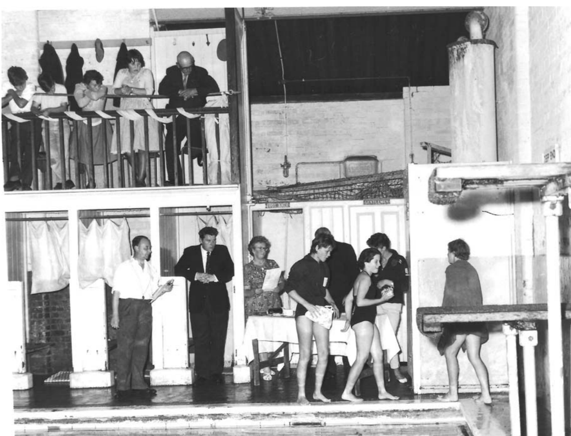
Photos from 50th Anniversary Gala held July 1961