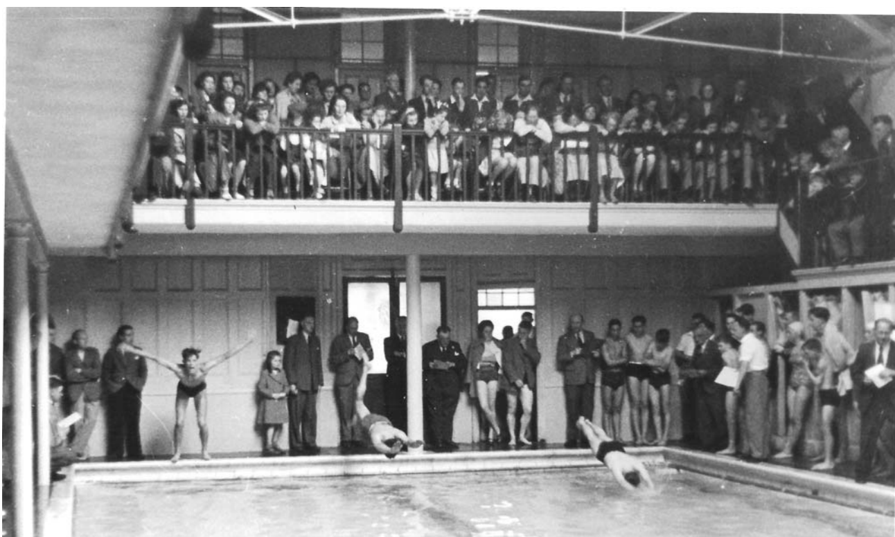
Swimming Competition 16th June 1948