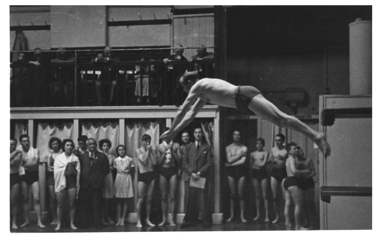
Diving Competition 16th June 1948